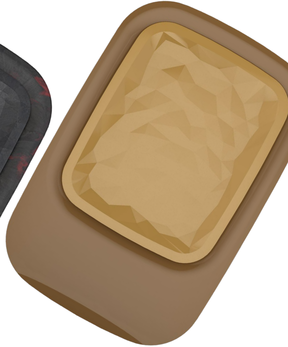
Tawny 22MOB45 (Base)

Solid Gloss Front / Matt Back Material: Bayblend® T85X R25 Only for automotive interior application Only available in Asia Pacific