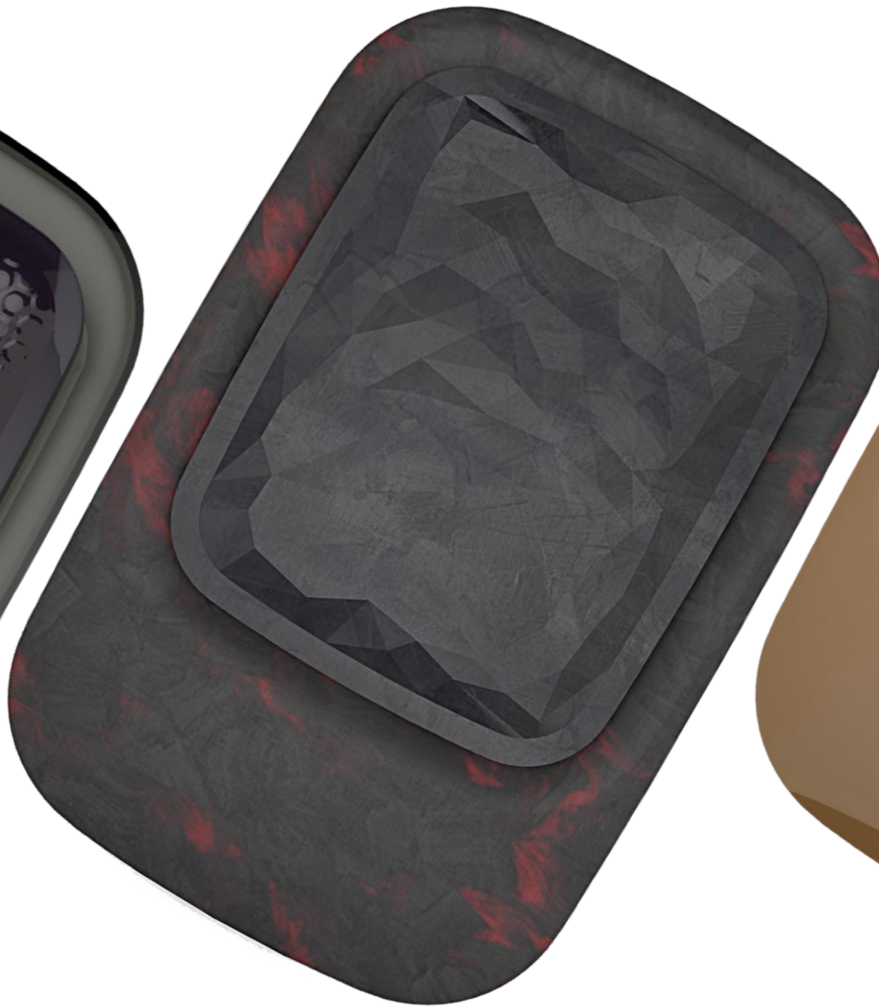
Flame 22MOB43 (Base)

Translucid Matt Back Material: Makrolon® Ai2457 Only for automotive interior application