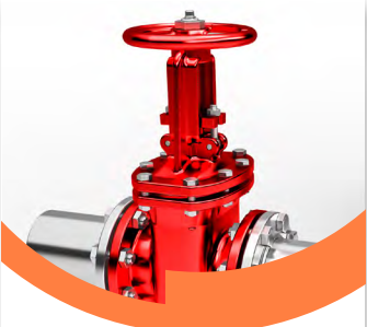
Low temperature or fast cure. Indoor polyesters.