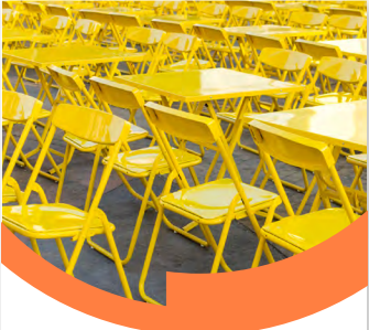
High loading acceptance and excellent flow. Indoor polyesters.