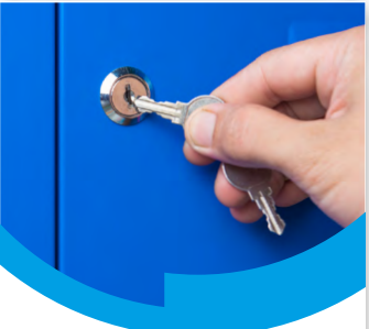
One shot matte, HAA systems. Outdoor polyesters.