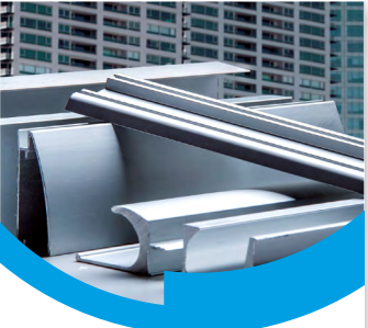
Low temperature or fast cure. Outdoor polyesters.