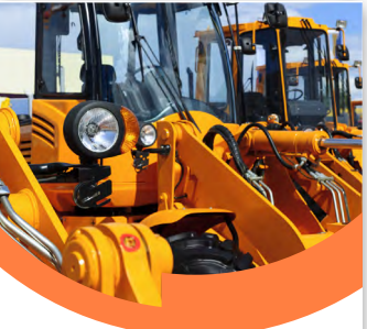
Corrosion protection. Indoor & outdoor polyesters.