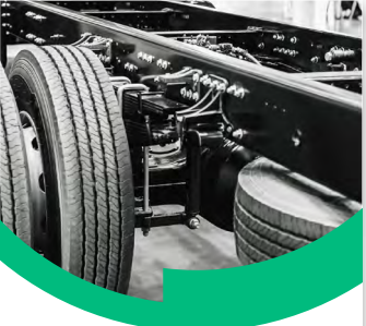
High loading acceptance and excellent flow. Outdoor polyesters.