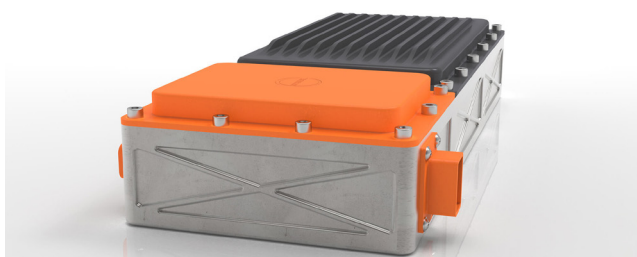
Figure 2: Simplified power electronics device (exemplary representation) potentially using orange Makrolon® FR6019 CTI and black, thermally conductive Makrolon® TC.

Makrolon® FR6019 CTI is designed for applications in power electronics and the electrical industry. It is impact resistant with a high Vicat temperature of 131 °C, which offers a ball indentation temperature of 120 °C according to IEC 60695-10-2 (ball pressure test).