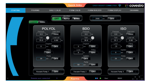
Human-Machine interface: process information display

Covestro Baulé® machines now feature the innovative High Performance Oven (HPO), which allows a much faster and accurate heating of the components. This optimized design can also be combined with the Low Exposure Oven (LEO) option which maximizes Covestro Elastomers' safety standards by further reducing the operator's exposure to chemicals when working with the oven.